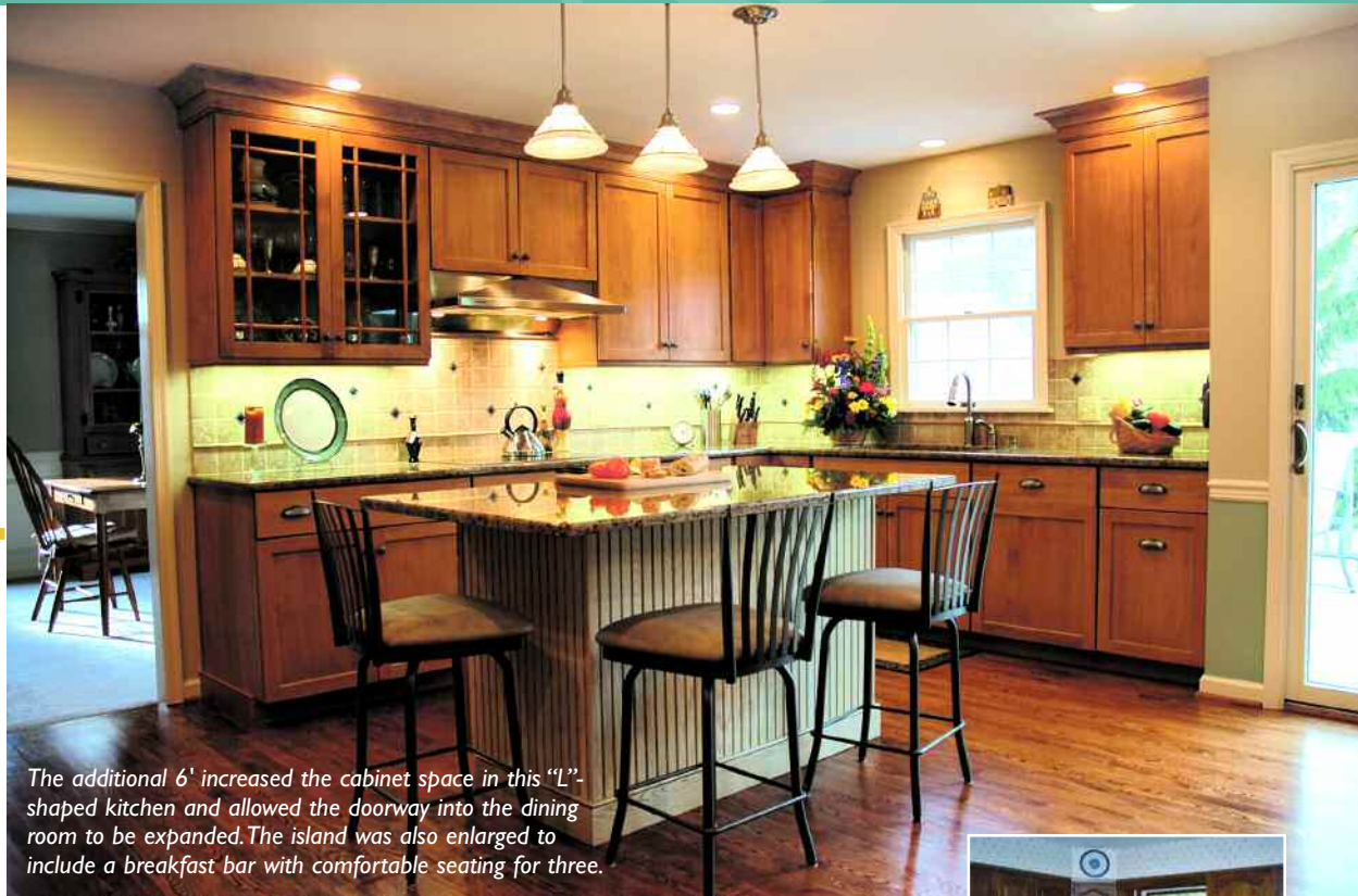
The additional 6' increased the cabinet space in this "L"-shaped kitchen and allowed the doorway into the dining room to be expanded. The island was also enlarged to include a breakfast bar with comfortable seating for three.

The kitchen now boasts extensive counter-tops, island breakfast bar and we were able to