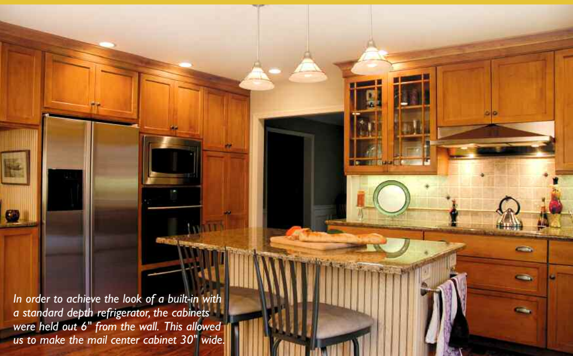
In order to achieve the look of a built-in with a standard depth refrigerator, the cabinets were held out 6" from the wall. This allowed us to make the mail center cabinet 30" wide.

HUB Design/Build is proud of our DelCY award that recognizes the professionalism and craftsmanship our team exhibited in this challenging project. Even more important to us, however, is our clients' satisfaction and pleasure as they enjoy their newly remodeled home. □