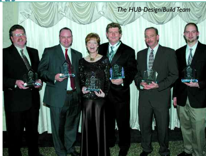
The HUB-Design/Build Team

When you are ready to remodel contact HUB Design/Build , a firm that has been recognized by its peers as excelling in the design and building process.