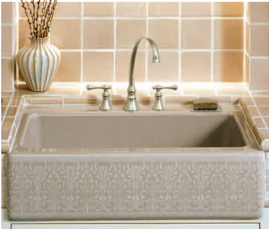
A graceful interlacing pattern, reminiscent of 17th century French lace from the renowned city of Alencon, is etched into the apron front of the Dickinson single-basin cast iron kitchen sink by Kohler.