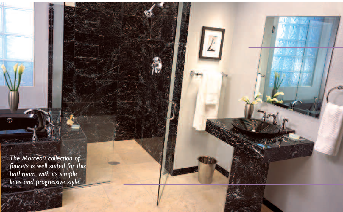
The Morceau collection of faucets is well suited for this bathroom, with its simple lines and progressive style.