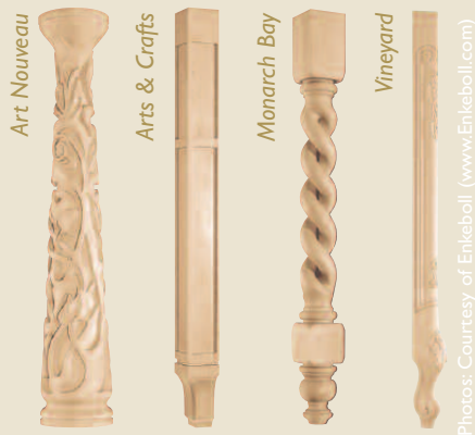
Enkeboll recently introduced these four new collections.

When planning your new kitchen, bathroom, office or family room, keep in mind that it is also possible in the 21st Century to embellish those rooms with hand-carved, embossed or turned wood architectural details. Manufacturers producing these products originally crafted them for the fine furniture industry, but since cabinetry has increasingly taken on the furniture look, the products are now being used on cabinets as well.