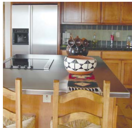
Stainless steel and wood make a great combination.

Copper is also entering the scene as a trendy choice for countertops in residential kitchens today. When the copper countertop is first polished and set in place, it will be a lustrous orange-gold color. Over