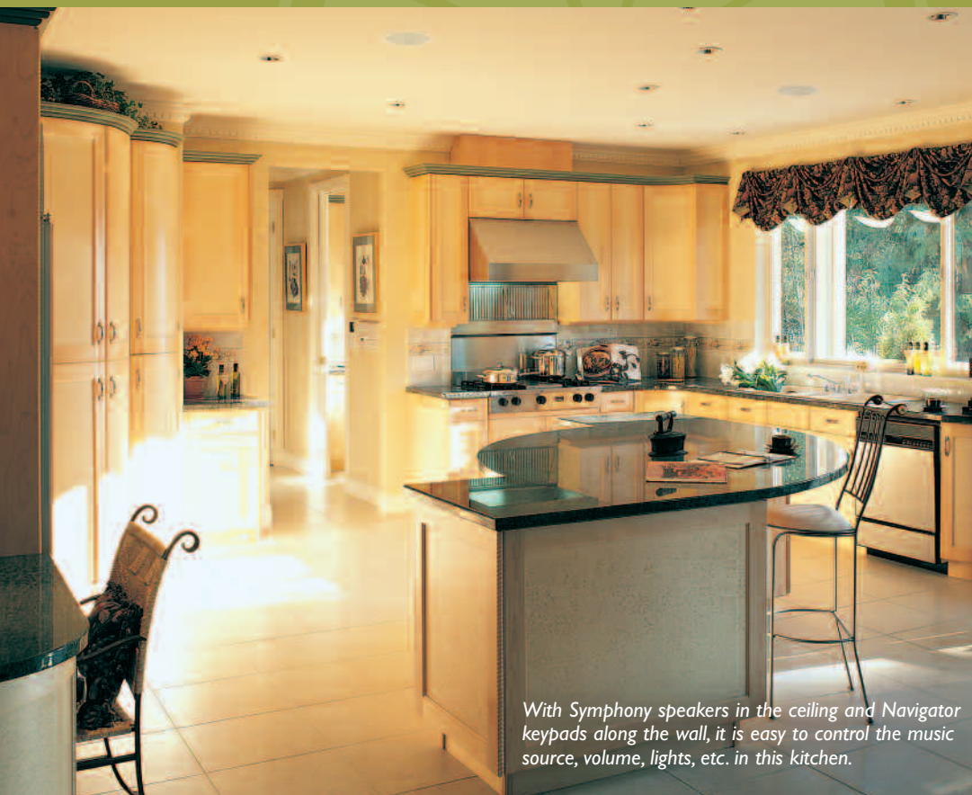
With Symphony speakers in the ceiling and Navigator keypad along the wall, it is easy to control the music source, volume, lights, etc. in this kitchen.