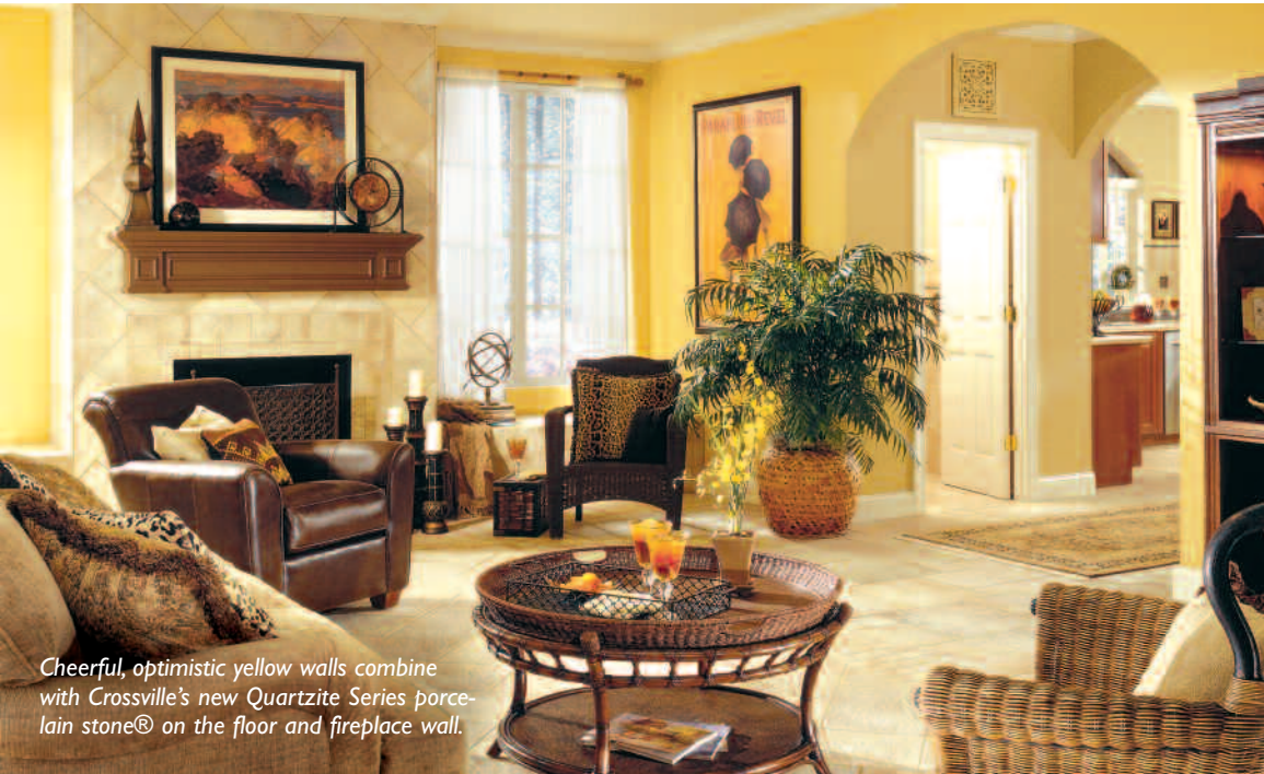
Cheerful, optimistic yellow walls combine with Crossville's new Quartzite Series porcelain stone® on the floor and fireplace wall.