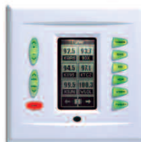
The Navigator K2 in-wall keypad employs both hard keys and a high-contrast, high-resolution LCD touch-panel display. The hard keys provide tactile feedback (power, volume up/down, channel up/down and customizable source and genre buttons), while the LCD touch-panel screen changes based upon the source you select, bringing up on the screen only the relevant buttons.

The Symphony Extreme in-ceiling speakers are thin, water and temperature resistant, and are perfect for saunas, whirlpools, boats, or anywhere outdoors.