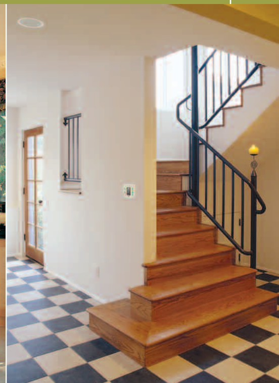
The Navigator K2 keypad in this hallway controls the Symphony in-ceiling speaker, as well as other functions.