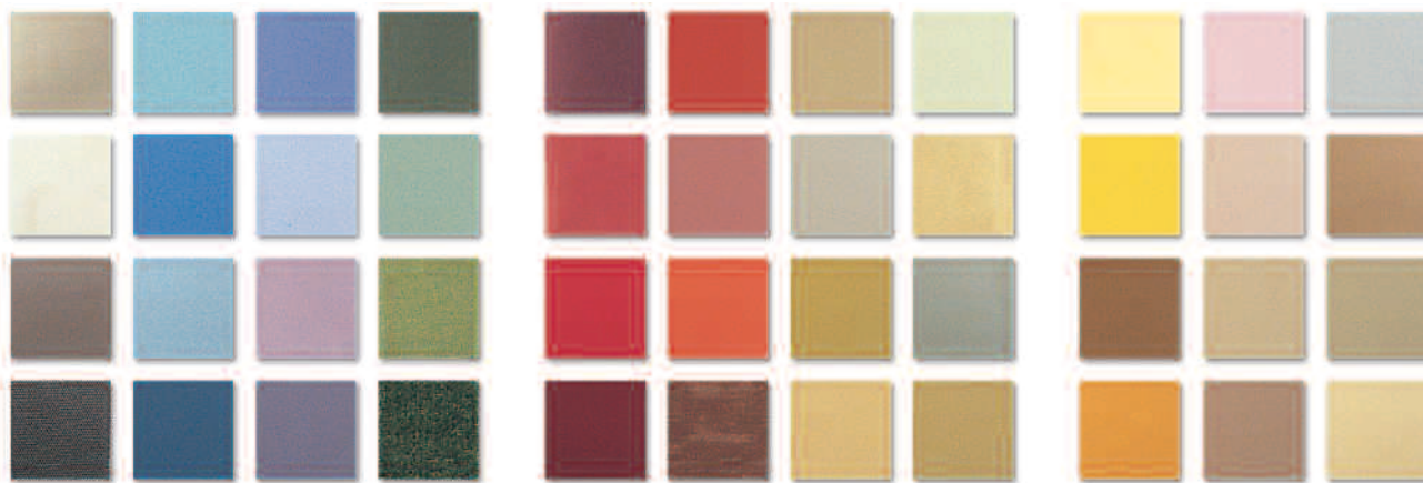
2004-2005 Environmental/Interiors Forecast Palette courtesy of the Color Association of the U.S. New York City.

The new palette has a high degree of warmth—emphasizing red and yellow-influenced color families, which are balanced by the cool air and water-inspired blues, greens and aquas. This forecast includes both cheerful brights to uplift us, as well as soft, mellow tones to relax us. It's all about “personal choice.” Look for